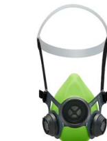
Half mask BLS SGE46