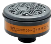
Filters BLS 400 series