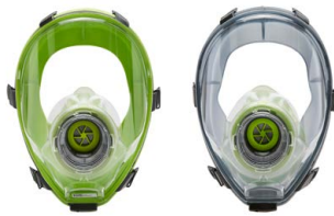
Full face masks BLS 5400 - BLS 5150