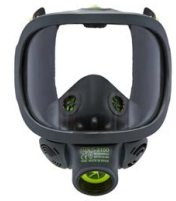
Full face masks BLS 3150 - BLS 3150V